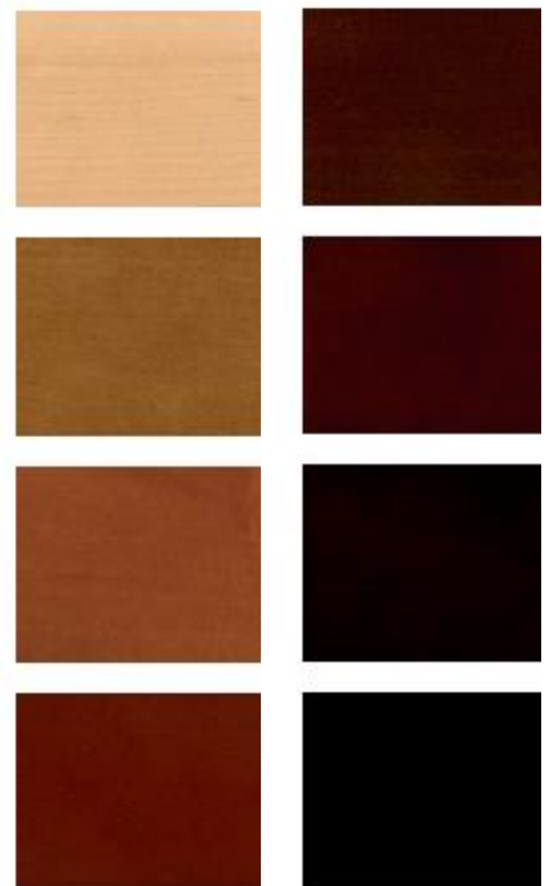
Standard Colors on Hard Maple

The selection of a nonporous surface such as an acrylic solid surface like Corian®, HI-MACS®, etc, or a high-pressure laminate top is strongly recommended for surfaces that will be used in dining or areas with food or in areas that will be cleaned extensively with chemicals.