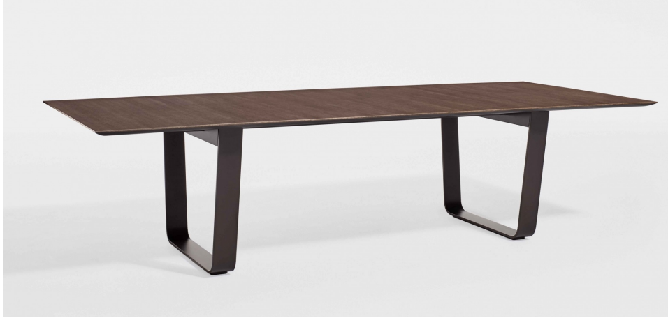
Nucraft – Baja table