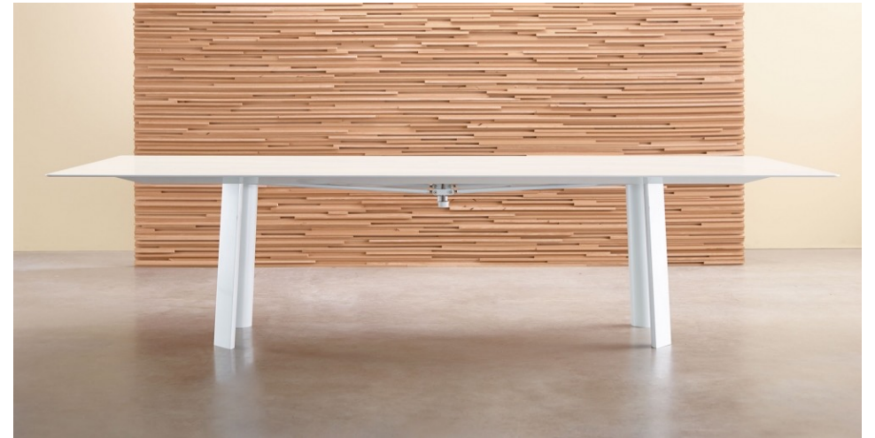
Nucraft – Kai table