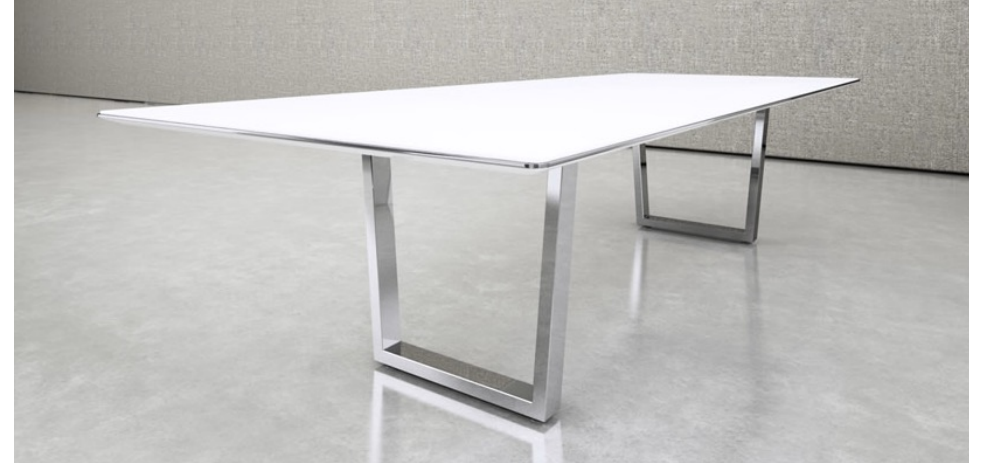
Prismatique – Ribbon table