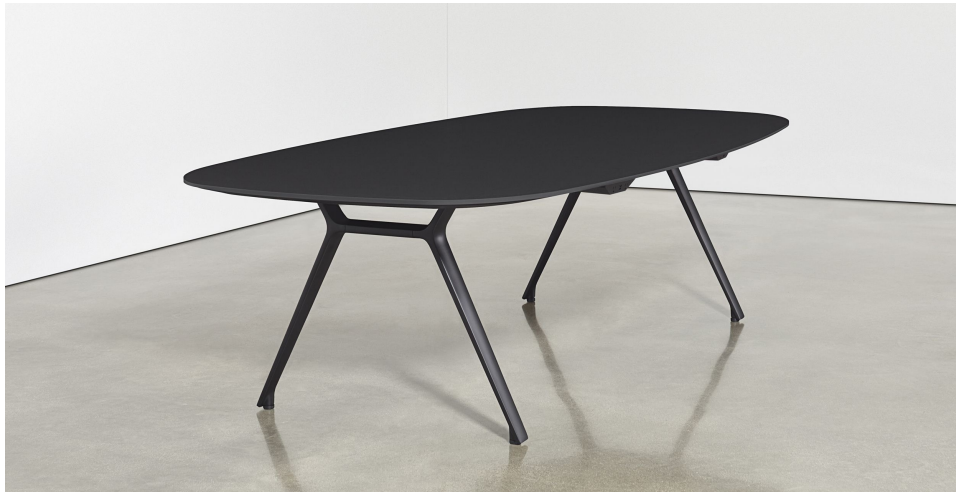
Halcon – Stratos table