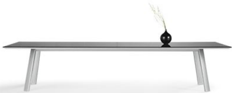
The Everyday Tech Table, Elevated

Today's open workspace requires various conference environments. From informal to formal, open or closed, 1-on-1 to larger groups, sitting on a couch, conference chairs or standing. Traverse Satellite is offered in many different sizes and shapes with three height options, all with the uniformed elegant frame and powerful functionality.